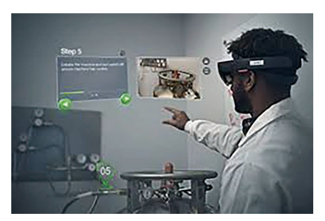
Figure2: Augmented Reality (AR) device for industry use

A variety of companies, including Meta, HTC, and HP, offer these common devices, but many are also experimenting with more complex tech to allow for an even further immersive experience. Prototype gadgets like haptic gloves, vests, and even full body suits provide a glimpse into how companies are thinking about creating thoroughly immersive ties to the Metaverse, allowing users to feel completely enveloped in their virtual reality.